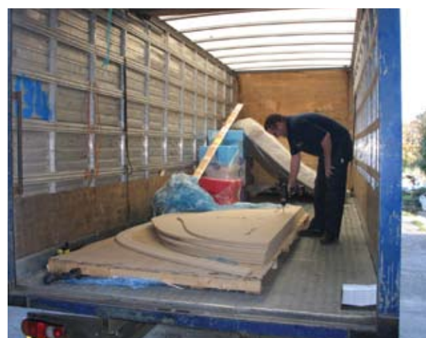
Below: The building moulds for Roxane arrive at Dick's Dorset workshop.

of tradition in hull shape and rig design but utilising more up-to-date techniques and materials which old-time seafarers would have surely used if they had been available. The design is about efficiency with simplicity, resulting in a clean set of lines with a basic, functional layout and a strikingly simple rig. The unstayed masts are made from carbon fibre which dramatically reduces weight aloft allowing the hull to remain slim while carrying a respectable sail area.