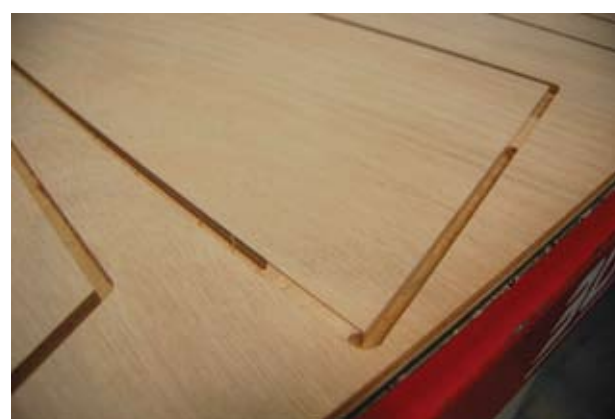
Top: CNC router cutting a plywood boat kit at Jordan Boats.